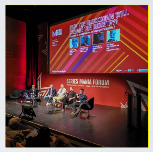
One of the well-attended panel sessions

French audiovisual industry — Series Mania has brought together a good number of viewers, creators, screenwriters, directors, and French and international television professionals to screen international TV fare.