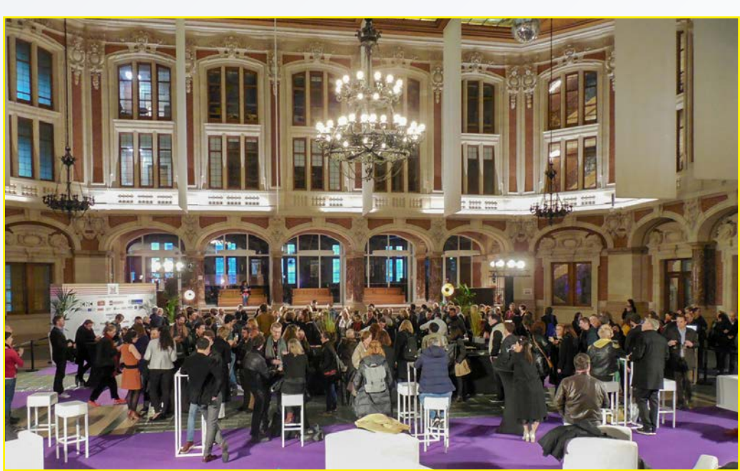
Events were held at the Commerce and Industry Hall before the headquarters moved to the Grand Palais.